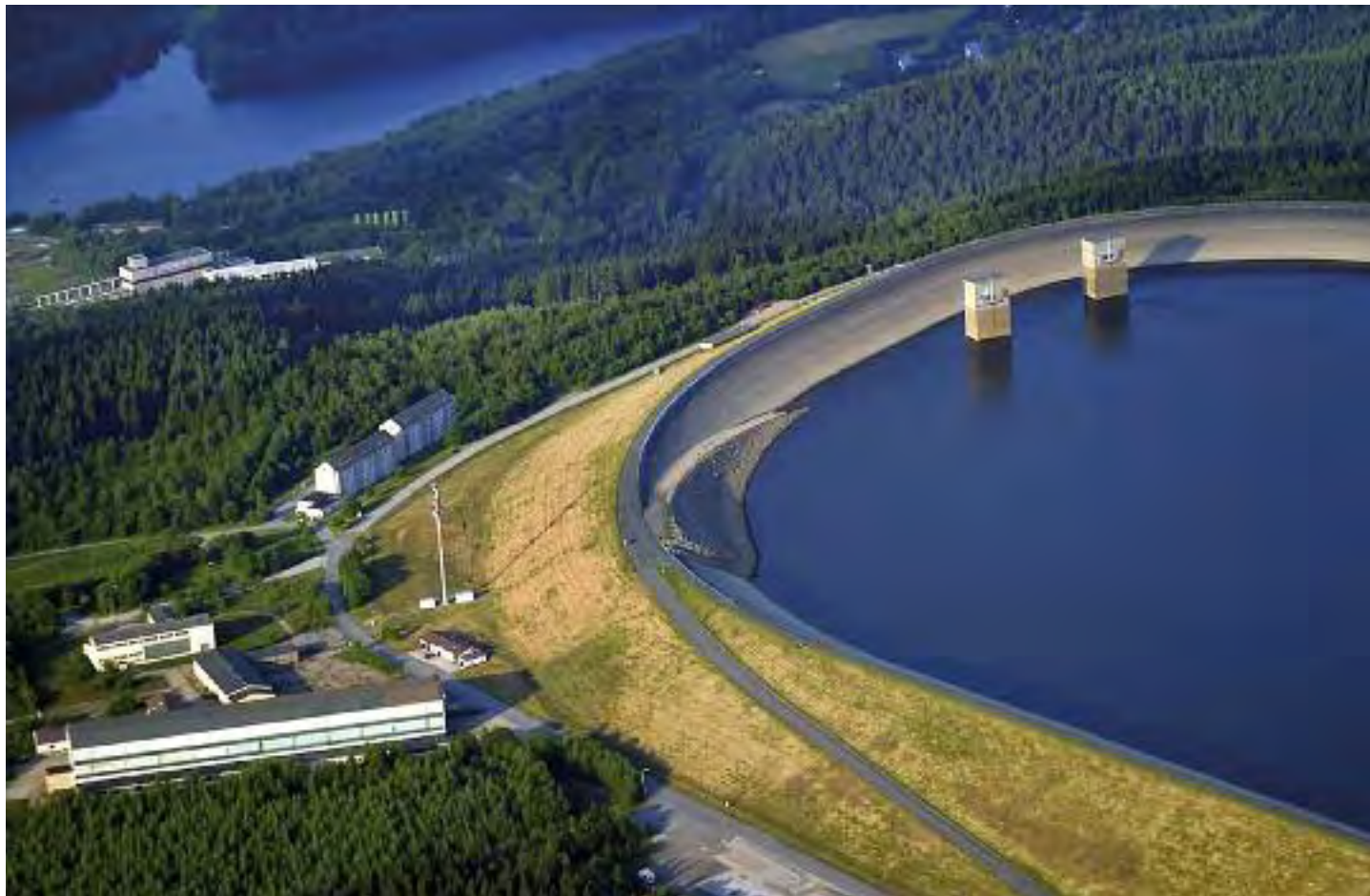
6 x 175 MW, Markersbach, Germany