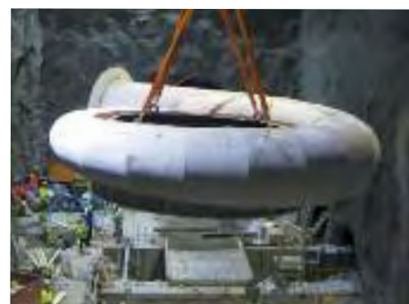
6 x 130 MW, Kárahnjúkar, Iceland