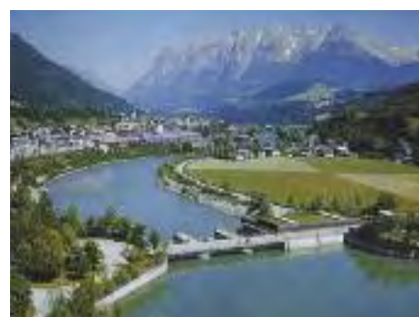
2 x 8 MW, Bischofshofen, Austria

All process signals should be received and managed without requiring multiple inputs. In order to enable efficient short and long range communication, as well as facilitate future expansion, it is essential to apply international standards here. Costs must be reduced to a minimum by using one hardware platform and thus reducing spare part inventory, and by applying integrated functions to keep maintenance and service activities to a minimum. Step-by-step expansion and integration of additional plant sections (switchyard or station service, for example) should always be an easy, straightforward task.